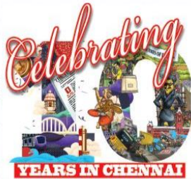
YEARS IN CHENNAI